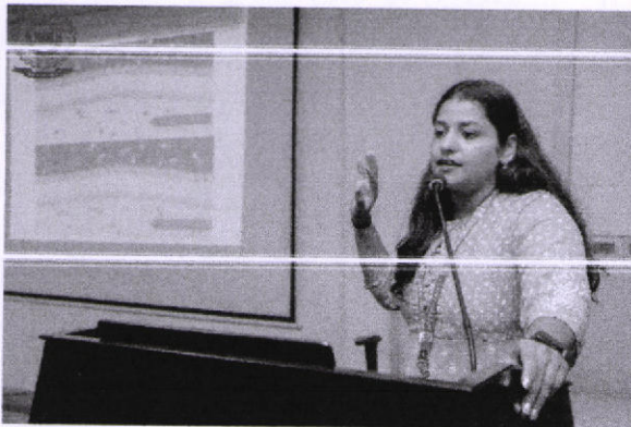
Resource person delivering the lecture.