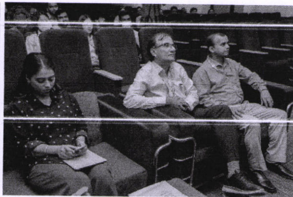
Faculty listening to the resource person.