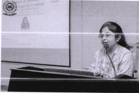
Co-ordinator welcoming the gathering.